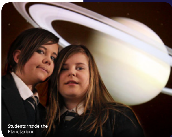
Students inside the Planetarium

'It was fascinating and gave us a lot to think about.' 'The Space Odyssey Show was brilliant and I really liked the way it was presented'.