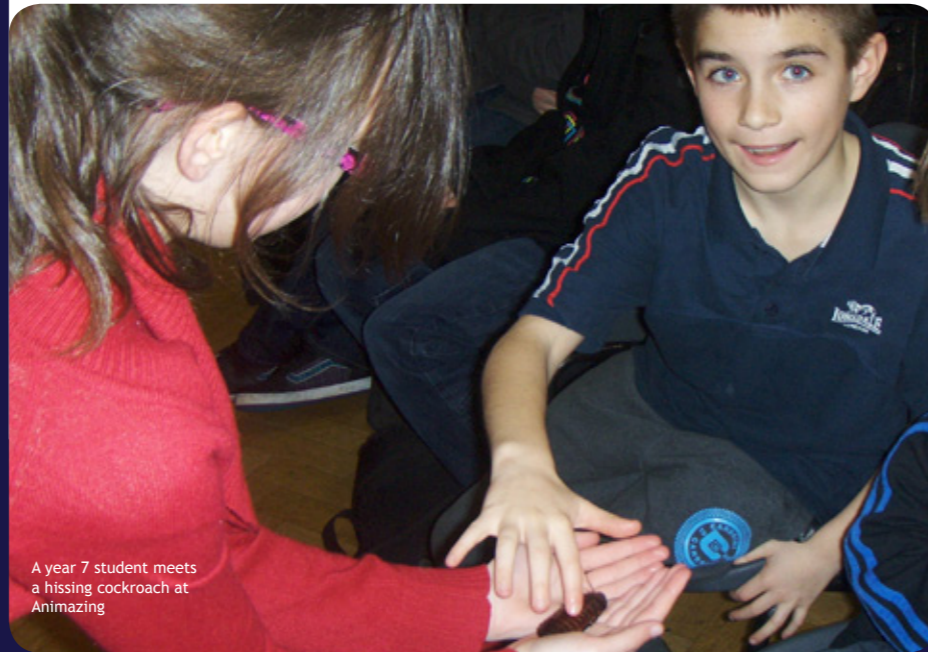
A year 7 student meets a hissing cockroach at Animazing

Year 7 studied how animals communicate, culminating in a visit from Animazing - a fantastic live show of animals, from hissing cockroaches to a chocolate skunk! In English, students studied 'The Jungle Book' and wrote a story or poem on a special relationship with a real or imagined animal, whilst in RE students learnt how animals are used to communicate about Gods.