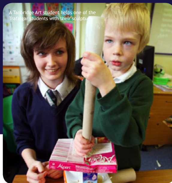
A Tanbridge Art student helps one of the Trafalgar students with their sculpture