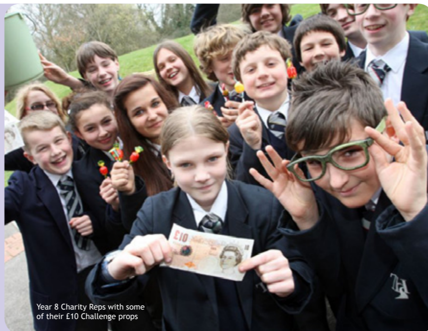
Year 8 Charity Reps with some of their £10 Challenge props