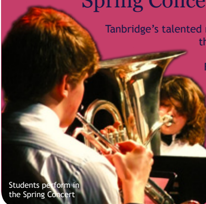
Students perform in the Spring Concert

Tanbridge's talented musicians took to the stage at The Capitol Theatre at the end of March for the annual Spring Concert.