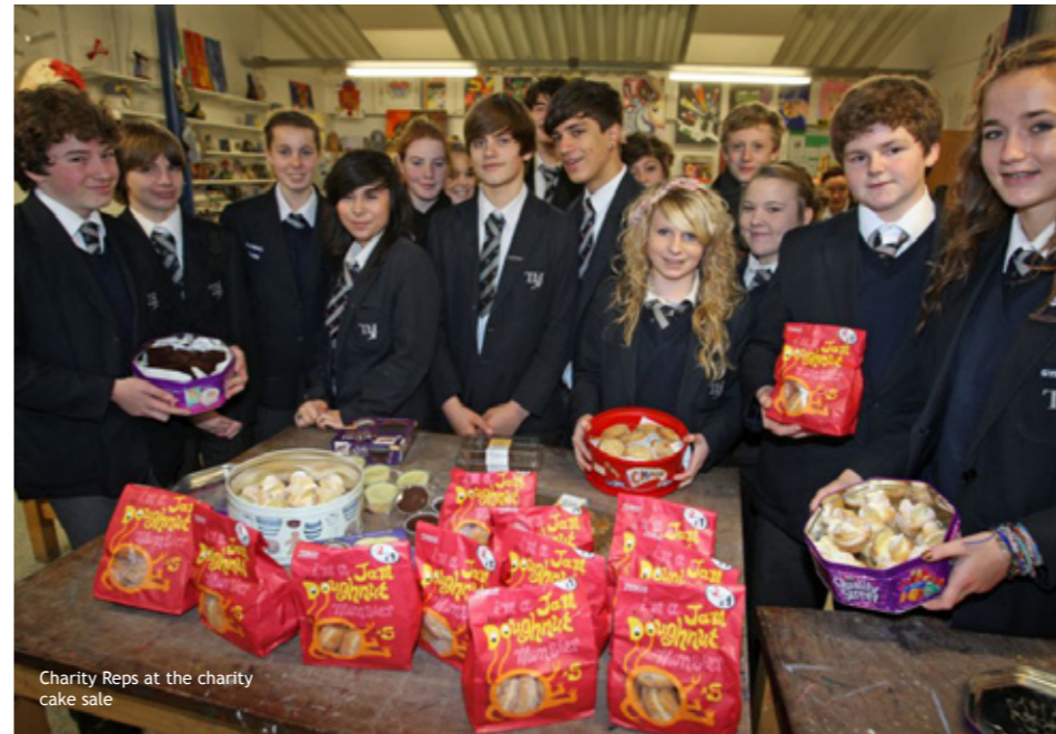
Charity Reps at the charity cake sale